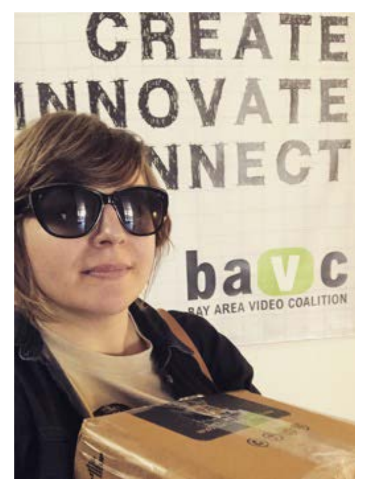
Tha author and the drives loaded up to be sent to the AAPB.

"WHILE CAPTURING IN THE DARKROOM WITH MY NOISE CANCELING HEAD-PHONES ON, THERE WERE MOMENTS WHEN I WOULD LAUGH OUT LOUD. OR CRY. THE SUBJECTS ARE HEAVY. AS IS THE PERSPECTIVE AND HISTORY."