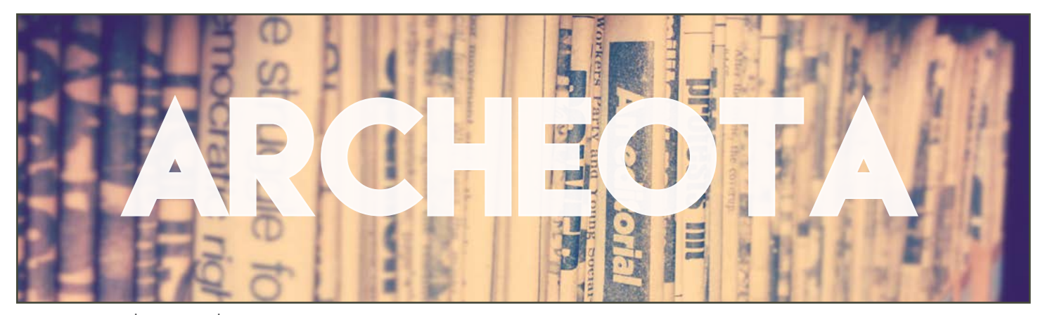
VOLUME 4 | ISSUE 1 | SPRING 2018