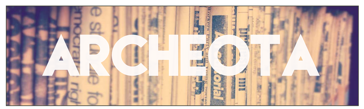
VOLUME 4 | ISSUE 1 | SPRING 2018