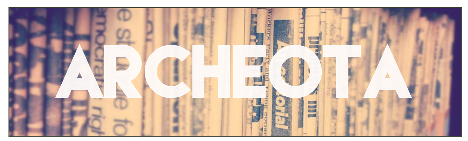
VOLUME 4 | ISSUE 1 | SPRING 2018