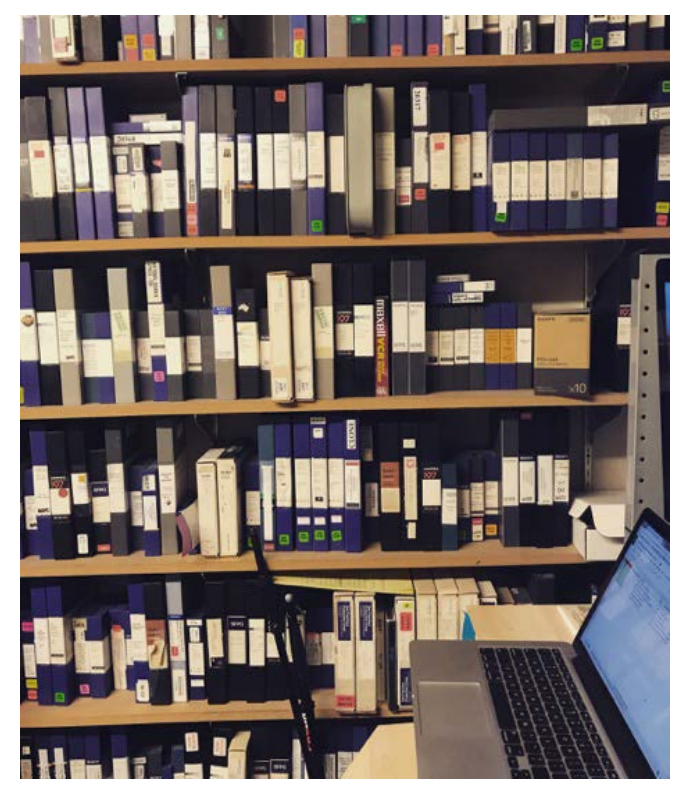
CAAM video archives.