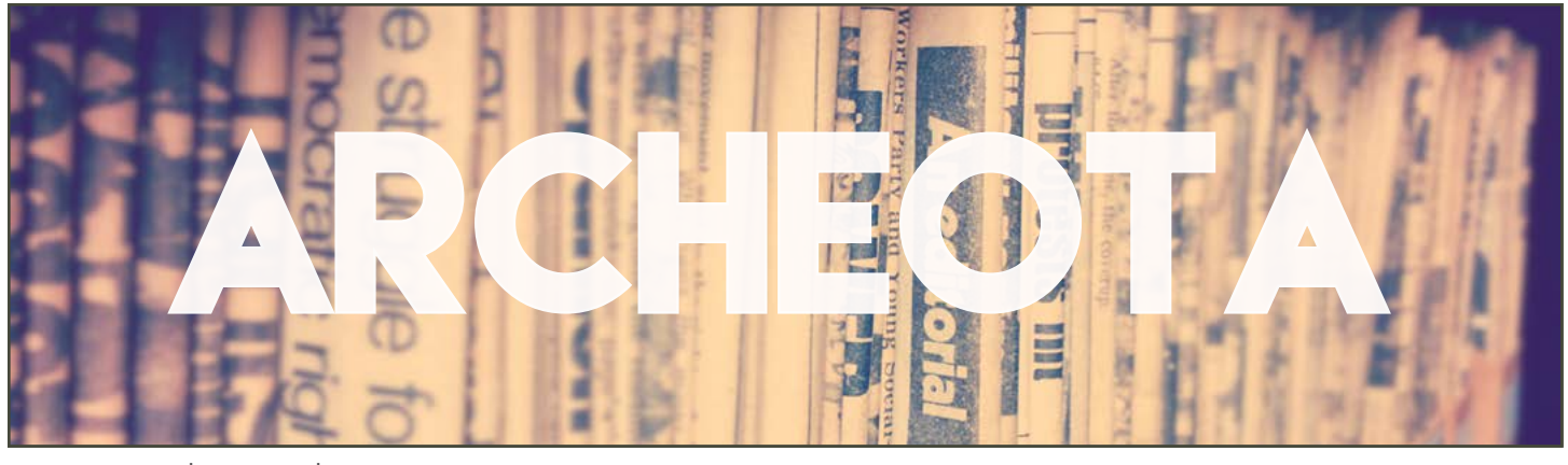
VOLUME 4 | ISSUE 1 | SPRING 2018