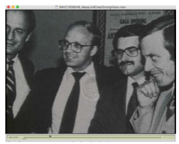
Many videos have some form of image error. The above "watermark" is a blemish on an old tape that can be seen in 1/30 of a second. After capturing, Yule would go back to any discrepancy to investigate further.

I began the program at SJSU with a focus on photography preservation as a means of utilizing my background in historic photography practices as a way to protect and preserve images for future generations. However, through my internship at the Hoover Institution Archives. I fell in love with working in all areas of archives, not just photographs, and have had the fortunate experience to process incredible collections including the Russian Revolution and the Vietnam War, each providing a unique glimpse of someone's life that I get to describe, organize, and preserve. When the fellowship was posted, I had a "this was made for me" moment and applied instantly. I have wanted to work